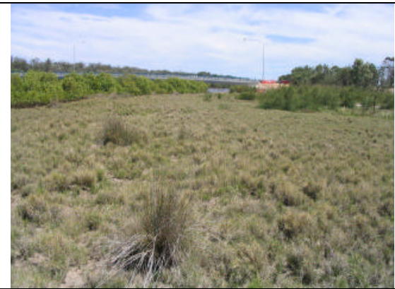
Plate 2e Survey 4 November 2003