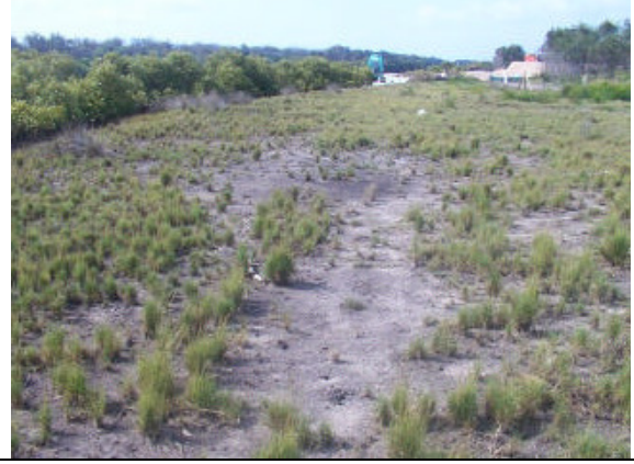
Plate 2b Survey 1 post transplanting January 2003