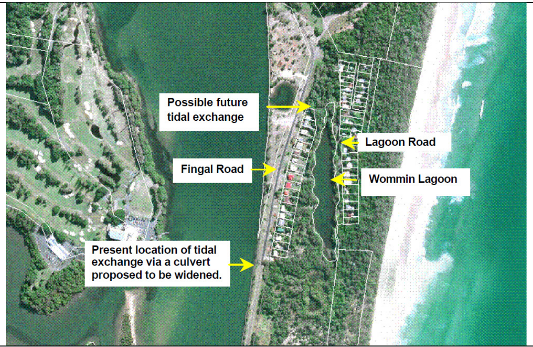
Plate 3 Wommin Lagoon at Fingal Head. The only source of tidal exchange with the Tweed River is via a convoluted channel at the southern end of the Lagoon.

Plate 3 shows the location of Wommin Lagoon which is a perched lagoon, surrounded by residential housing and only experiencing tidal exchange via a road culvert at the southern end of the Lagoon (Plate 4A).