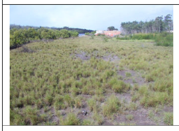
Plate 2c Survey 2 May 2003