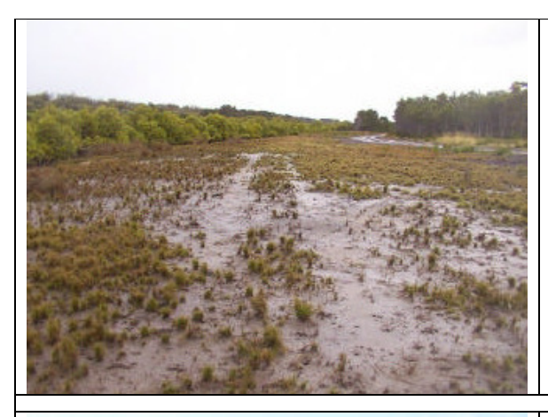
Plate 2a Baseline Survey prior to transplanting September 2002

The project aimed to create 60m^2 of saltmarsh within the compensation area is considered successful due to the substantial improvement in the quality of saltmarsh at the 130m^2 compensatory site. Some of this increase would is attributable to the transplanting of saltmarsh from the bridge construction site however removal of trampling of the saltmarsh by pedestrians, motorbikes and cars is also a key factor. The site has remained fenced to prevent degradation and the land is now within an Environmental Protection (Habitat) Zone.